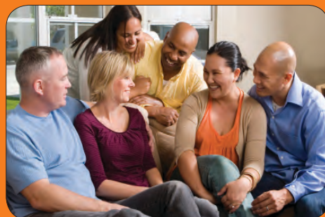
New! The Power of Gratitude