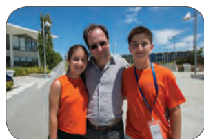
Parent & Youth