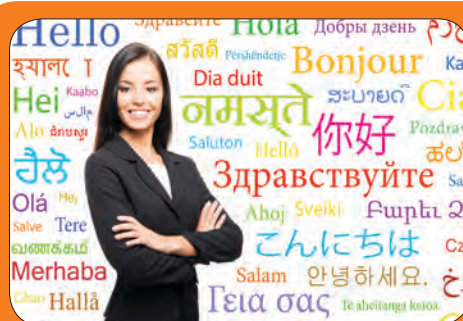
Languages-Spanish, French, Chinese, American Sign